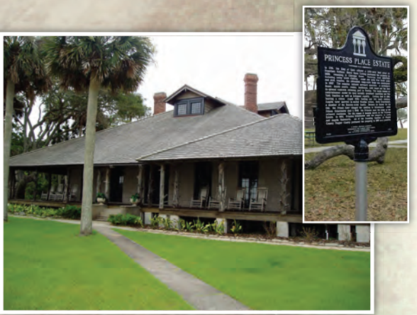
Princess Place Preserve

In March 2004 the Bunnell Chamber of Commerce and the Flagler County Chamber of Commerce formed a Historic Preservation Committee. The Committee was formed in order to apply for a Scenic/Heritage Highway Designation for the group of roadways that make up the proposed Heritage Crossroads: Miles of History Heritage Highway. From this initial effort the Corridor Management Entity (CME) was officially formed and recognized as a spin-off of the Historic Preservation Committee. Since that time, the CME has met monthly and worked very hard to make this Florida Scenic Highway designation a reality. The CME received notice of approval from the Florida Department of Transportation (FDOT) in 2008 as the states first heritage highway under the Scenic Highway Program. Since that time the CME has worked diligently to accomplish its goals and meet its mission.