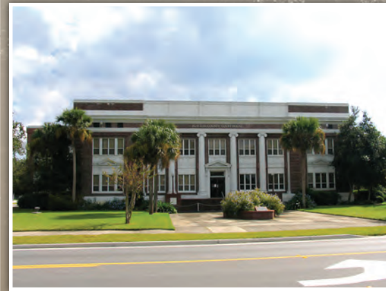
Flagler County Court House

The CME envisions a unique opportunity for the curious and adventurous to experience the byways of a region rich in history and potential. The 92-mile loop and spur route follows the ongoing story of exploration and colonization that began 12,000 years ago and continues today. The Heritage Crossroads corridor is a key component of the "Southern Passages: the Atlantic Coast," an emerging National Heritage Area (NHA) that roughly traces the original Kings Road of the 1700s that begins to the south at New Smyrna Beach, Florida with a northern limit that continues past the Georgia terminus north to Georgetown, South Carolina.