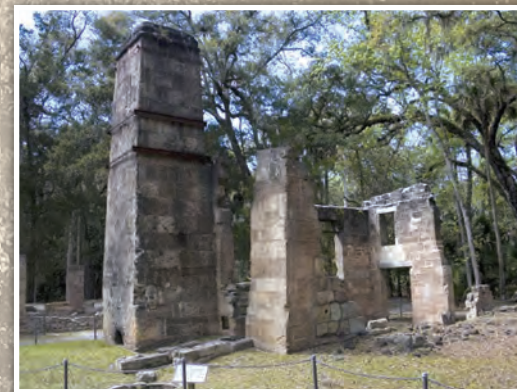
Bulow Plantation Ruins Historic State Park

These historically significant components will be brought together as part of the Heritage Crossroads corridor to visually enhance the human spirit with the unique stories and connections with nature. The crossroads will wed the past with the present and serve as an example for understanding and appreciation for the heritage of the area through community pride and a sense of place. The Heritage Crossroads Vision is to protect and promote the historical resources of the region that encompasses portions of Flagler, St. Johns and Volusia Counties within the 98-mile corridor through shared community goals and objectives.