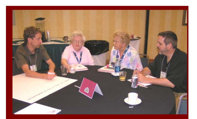
Goal Setting Session