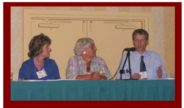
"The Corridor Management Plan is based on the work of several citizen teams – this allowed the CMP to be <u>totally grassroots</u>"

Answer – Natural Resource Agencies are the bedrock of the CAG. Members of the Corridor