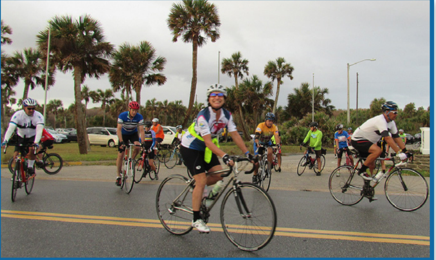
Although the weather was not picture perfect, the early drizzle did not dampen the spirits of cyclists.

These efforts helped provide the community with reassurance that the area was ready to welcome visitors.