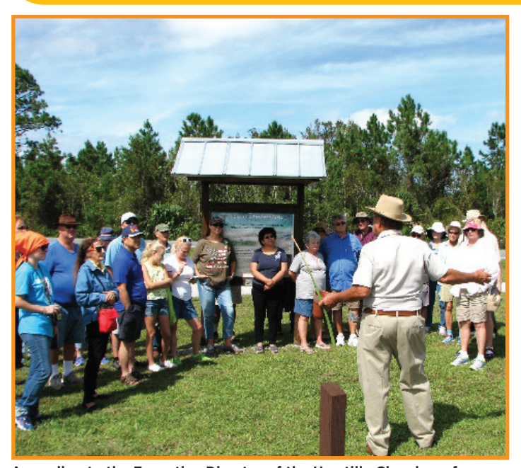
According to the Executive Director of the Umatilla Chamber of Commerce, the Florida Wildlife Festival, including the Florida Black Bear National Scenic Byway bus tour, not only raises awareness of important conservation issues, but has a significant economic impact on the local community.