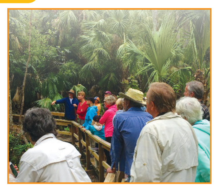
The guided trail walks hosted each year along the Ormond Scenic Loop & Trail instill an appreciation for the scenic and natural resources of the byway. In 2018, the March trail walk departed from the Fairchild Oak at Bulow Creek State Park, and in November participants walked the Red Trail in Tomoka State Park.

Held early on Saturday mornings, the Ormond Scenic Loop & Trail guided walks teach participants about local plant and animal species as well as threats to natural resources, from rising temperatures to the increasing salinity of ground water due to rising seas.