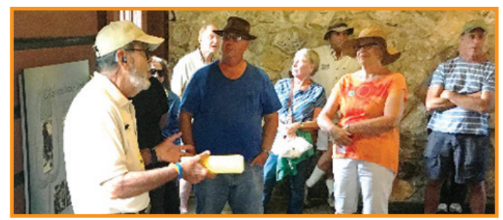
Previously known as the Florida Black Bear Festival, the Florida Wildlife Festival's focus has expanded to include not only the Black Bear but other native species, both imperiled and common to the region.

The Florida Black Bear National Scenic Byway crisscrosses the Ocala National Forest, the first National Forest established east of the Mississippi River. The forest contains the world's largest sand pine scrub, an increasingly rare natural community that is home to plants and animals found nowhere else on earth. The Florida Wildlife Festival began fifteen years ago to increase awareness and promote the safe coexistence of humans and wildlife.