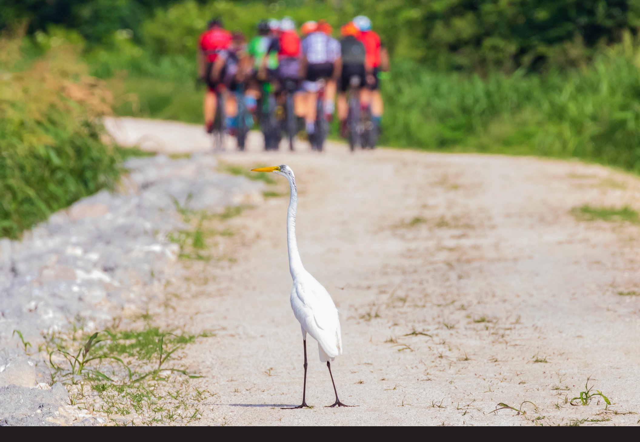
Photo: Great Egret on Green Mountain , by Lynn Folts Green Mountain Scenic Byway