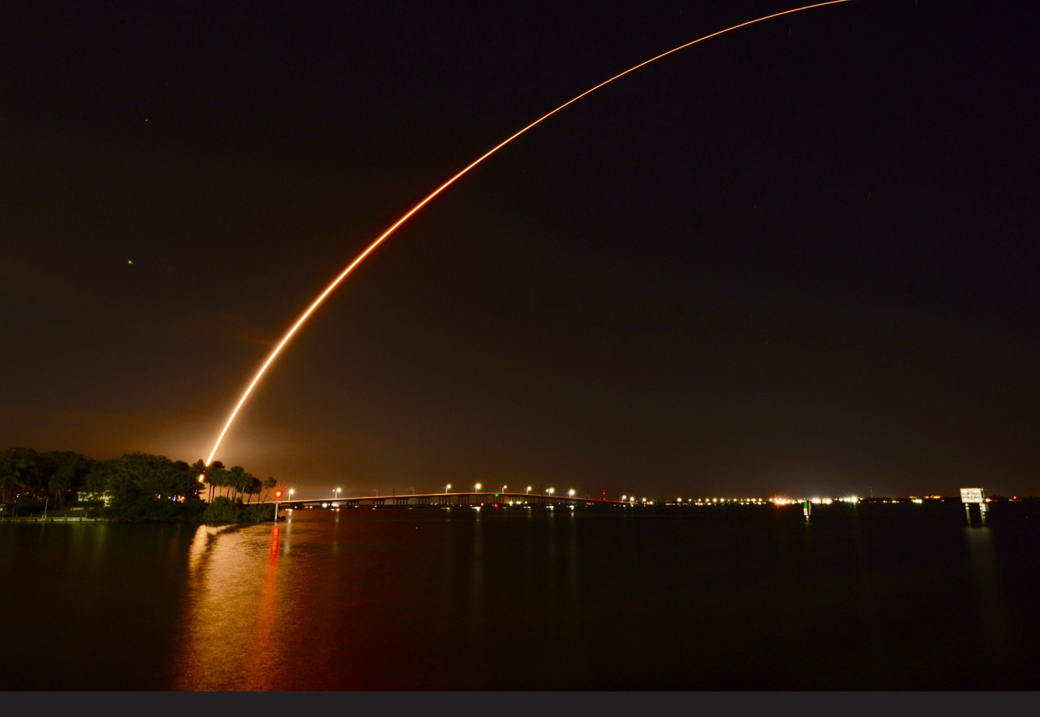
Night Time Launch Indian River Lagoon National Scenic Byway