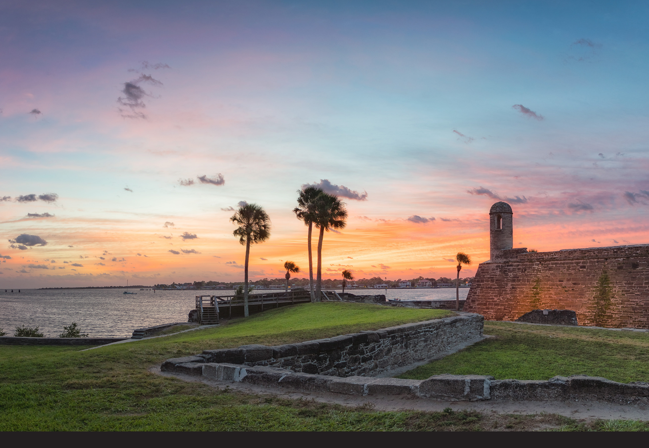
A1A Scenic & Historic Coastal Byway