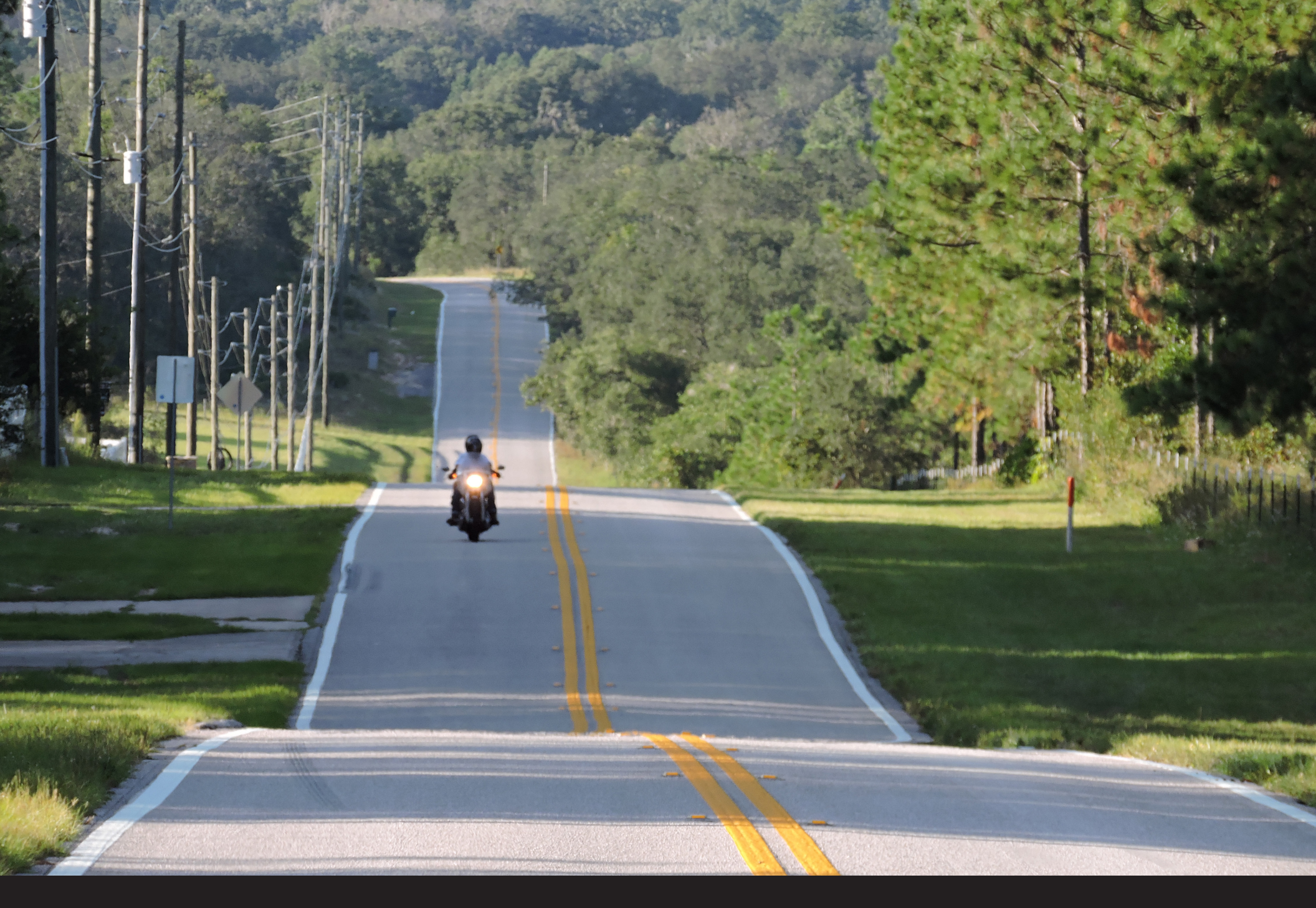
Photo: On the Road Again , by Diana Suarez Green Mountain Scenic Byway