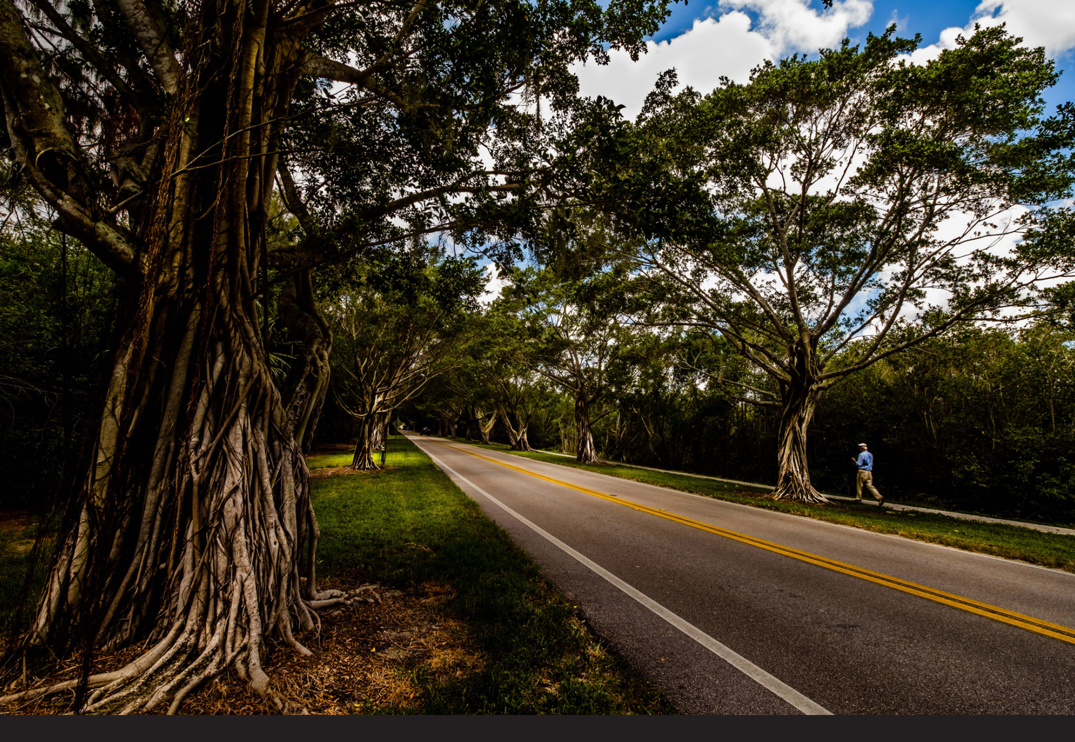
Photo: A1A Bridge Road Banyans , by John Masters Indian River Lagoon National Scenic Byway