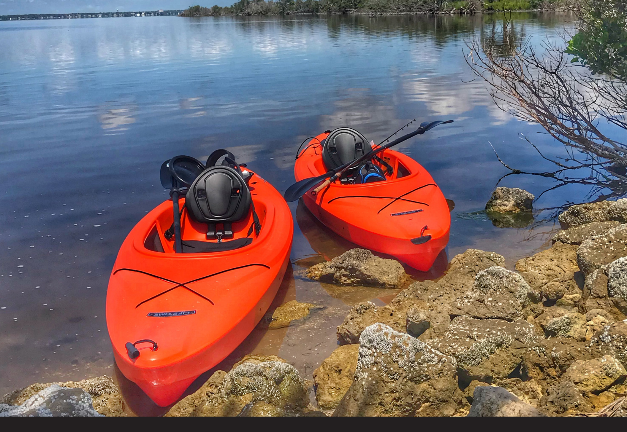
Photo: Kayak Twins , by Pamela Mistyhn Indian River Lagoon National Scenic Byway