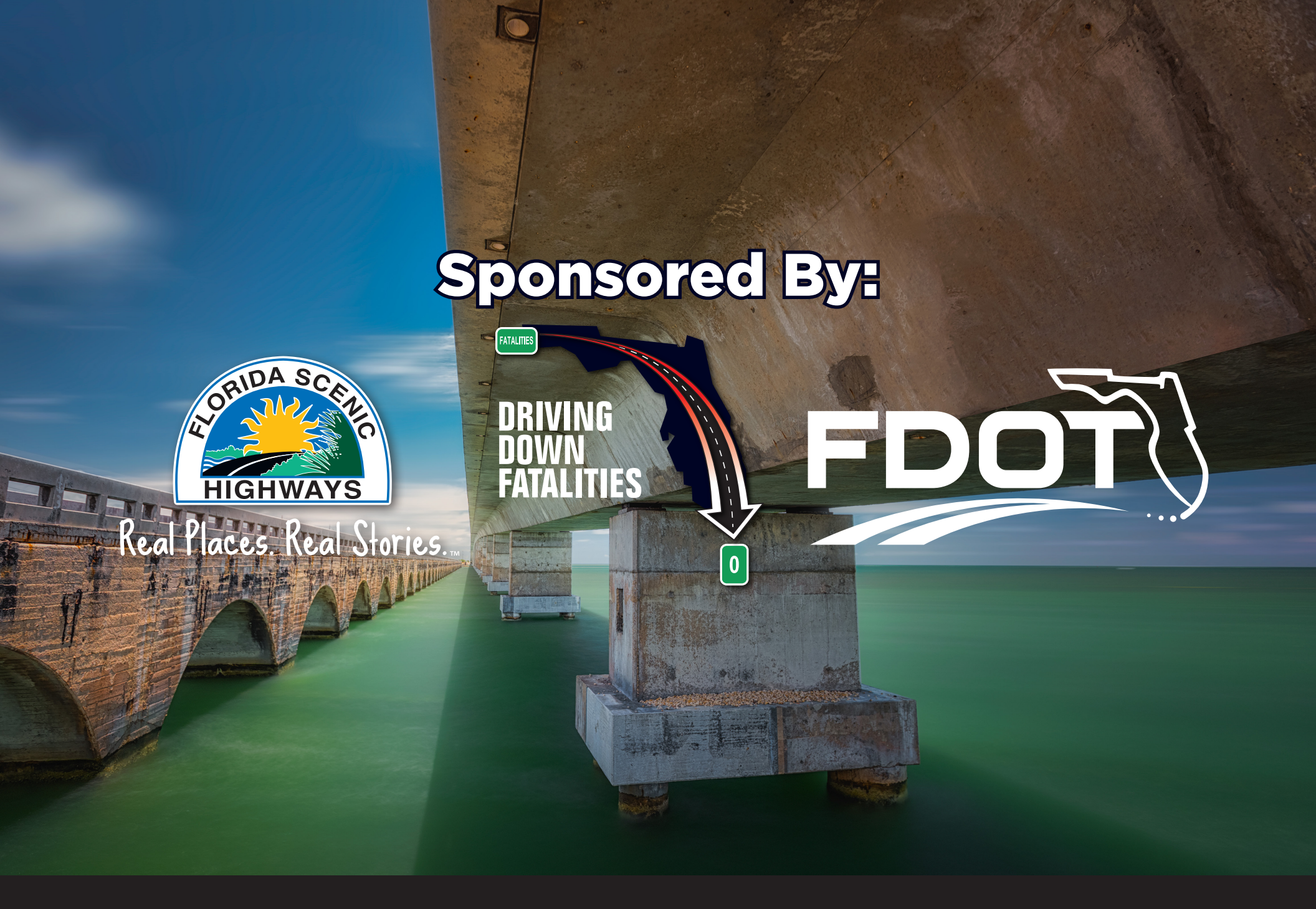
Photo: 7 Mile Bridge , by Frank Delargy Florida Keys Scenic Highway All-American Road