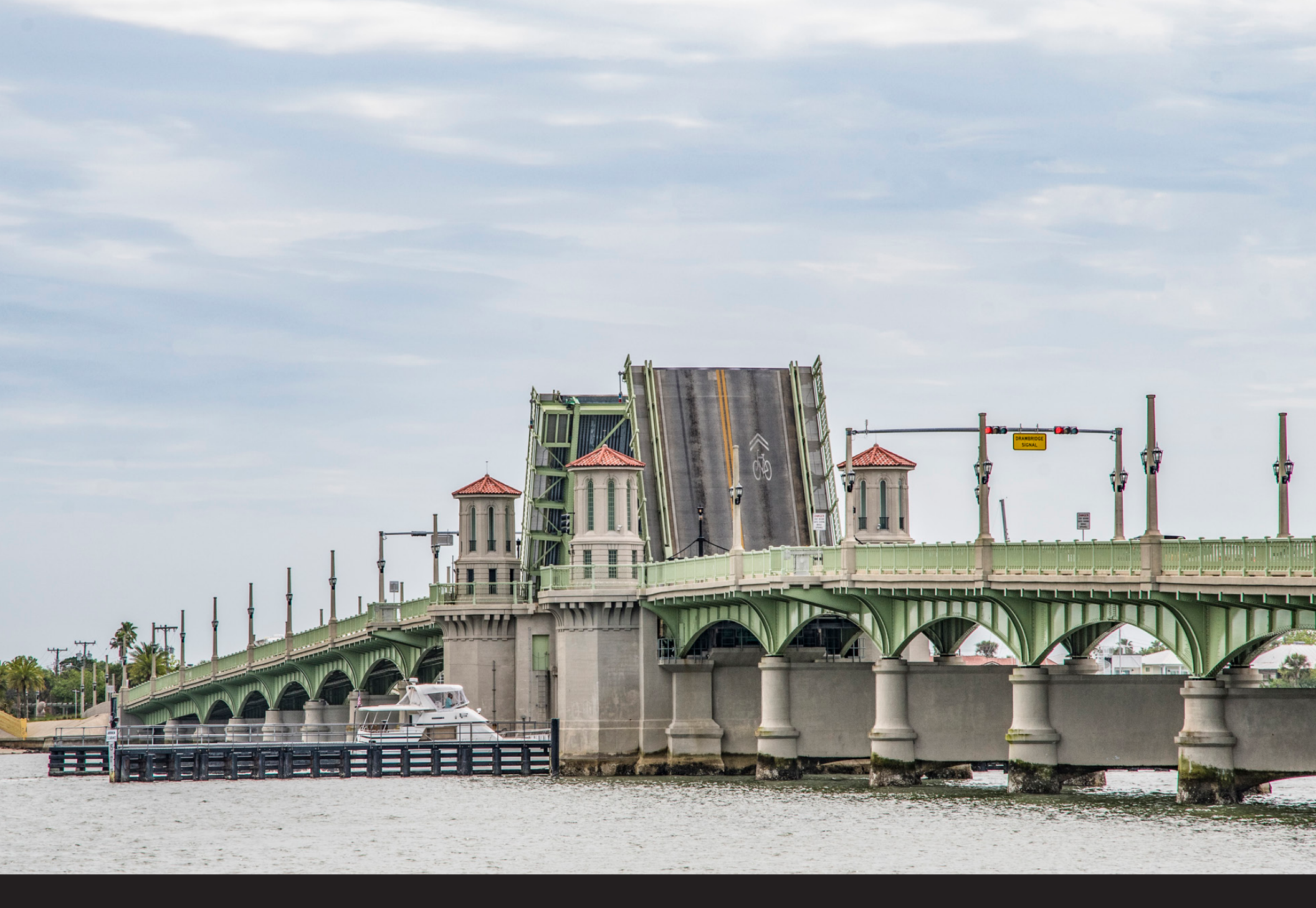
Bridge of Lions A1A Scenic & Historic Coastal Byway