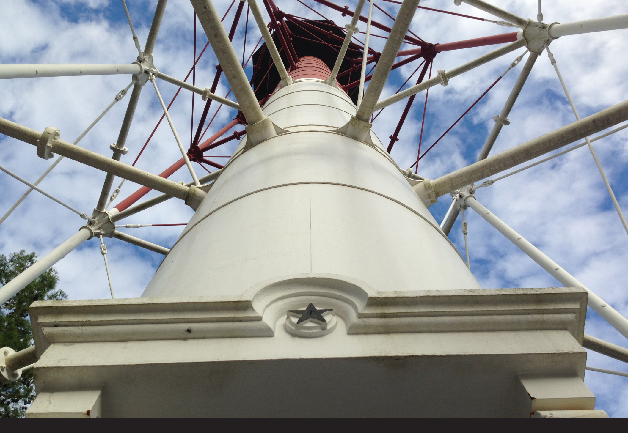
Photo: Carrabelle Lighthouse , by Cheryl Gainer McCall Big Bend Scenic Byway