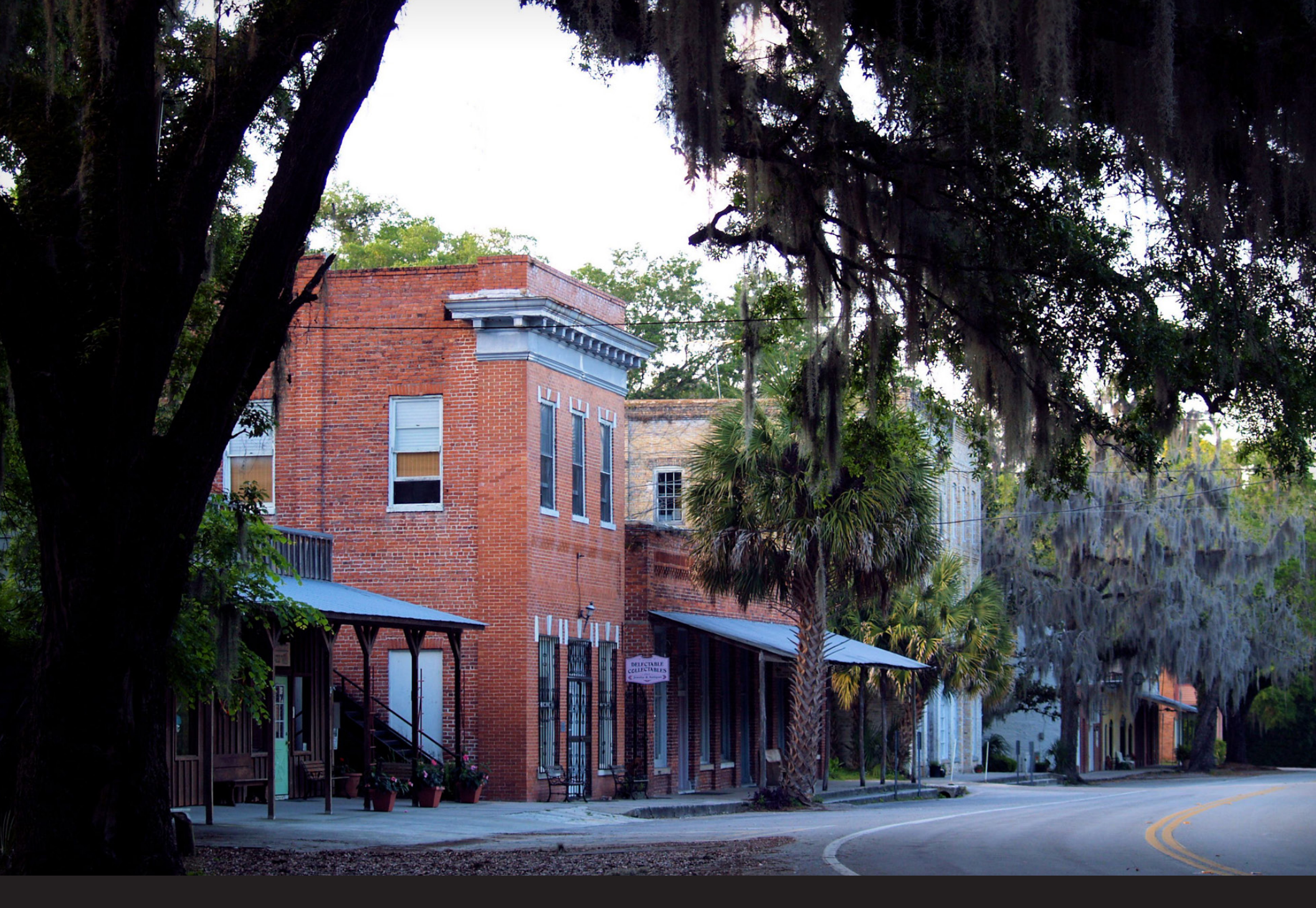
Photo: Highway 441 Micanopy Old Florida Heritage Highway