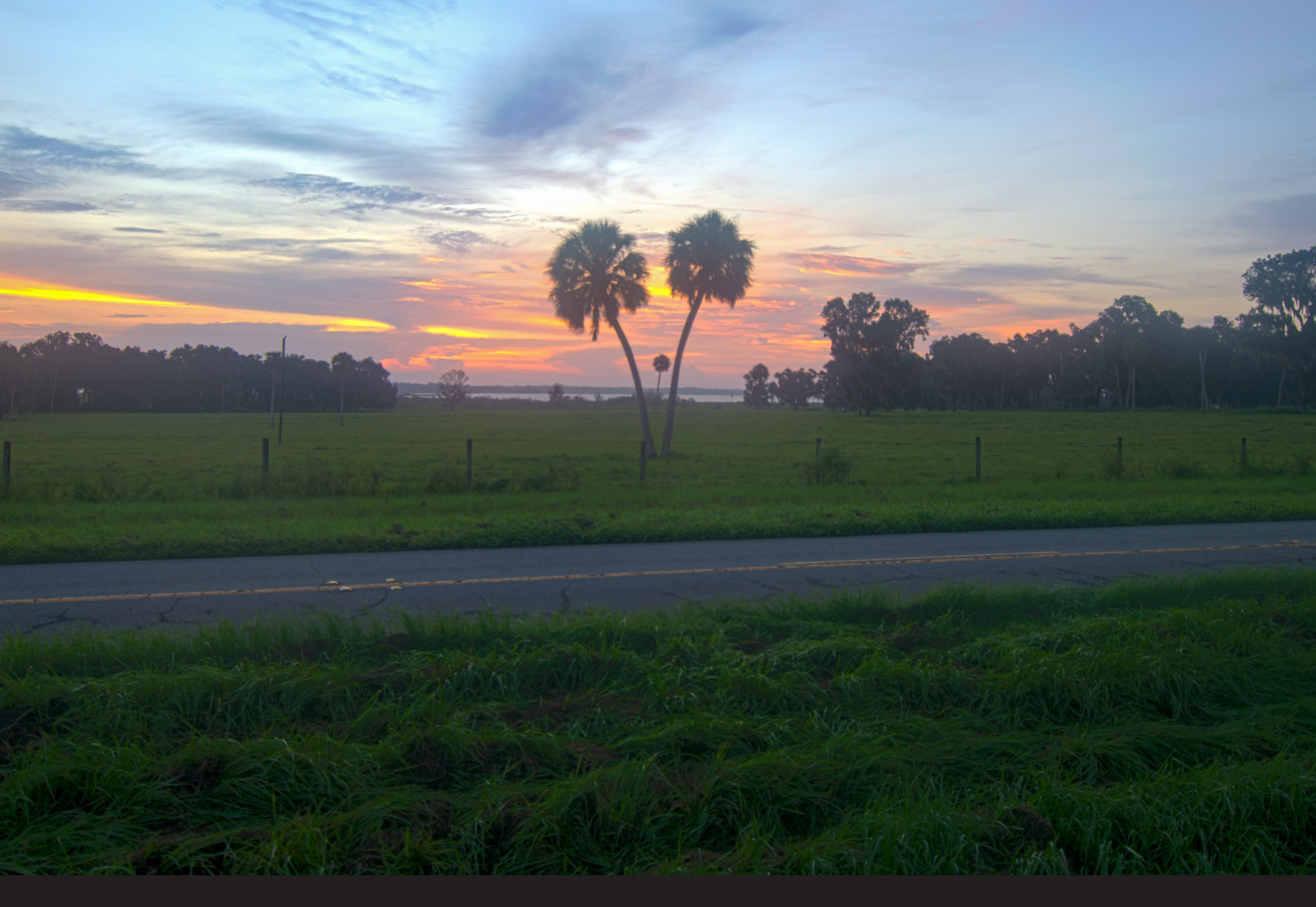
Photo: Evinston Sunrise , by Terence Cake Alachua County Road 225, Old Florida Heritage Highway