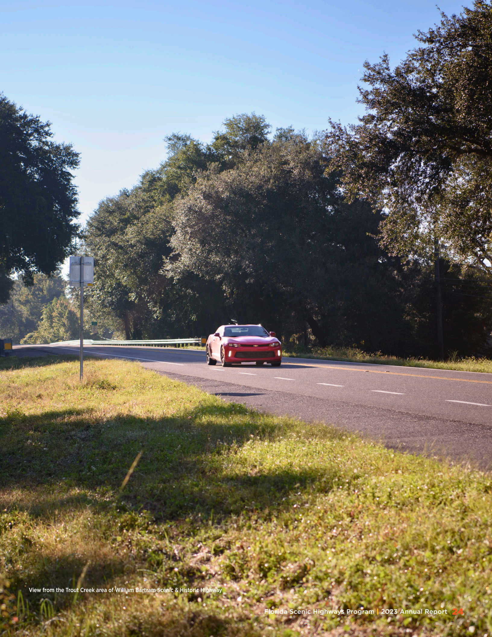
View from the Trout Creek area of William Bartram Scenic & Historic Highway