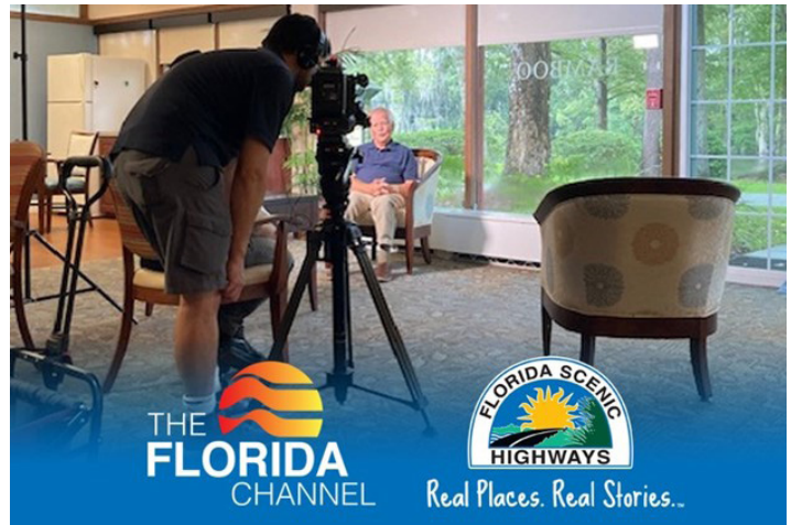
Ongoing filming for the Florida Crossroads program