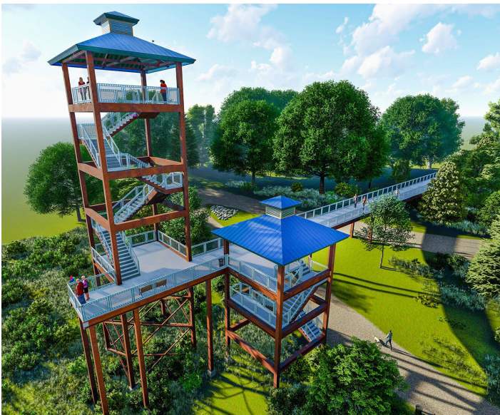
Artist rendering of the completed addition to the Overlook at Lake Apopka

In 2016, a trail was opened from the Overlook to 20,000 acres of Lake Apopka Northshore. This area included fish and wildlife resources, natural habitat, and hiking and bike trails. With increased connections for the community from the trail and growing vegetation obscuring the view from the Overlook, a desire to enhance the Overlook grew. FDOT partnered with Green Mountain Scenic Byway, Lake County, and the St. Johns River Water Management District to apply for the first National Scenic Byway Program Grant Cycle in more than 10 years with the vision of enhancing this important feature of the Byway. The Florida Scenic Highway Program and Green Mountain Scenic Byway look forward to the construction of the new tower and the enrichment it brings to the area. Throughout 2023, the team worked together to coordinate with FHWA to develop a grant agreement and move the project forward. The NSB grant did not reopen during the 2023 FY, but the Florida Scenic Highway Program remains prepared to support byways in their applications when the funding becomes available once more.