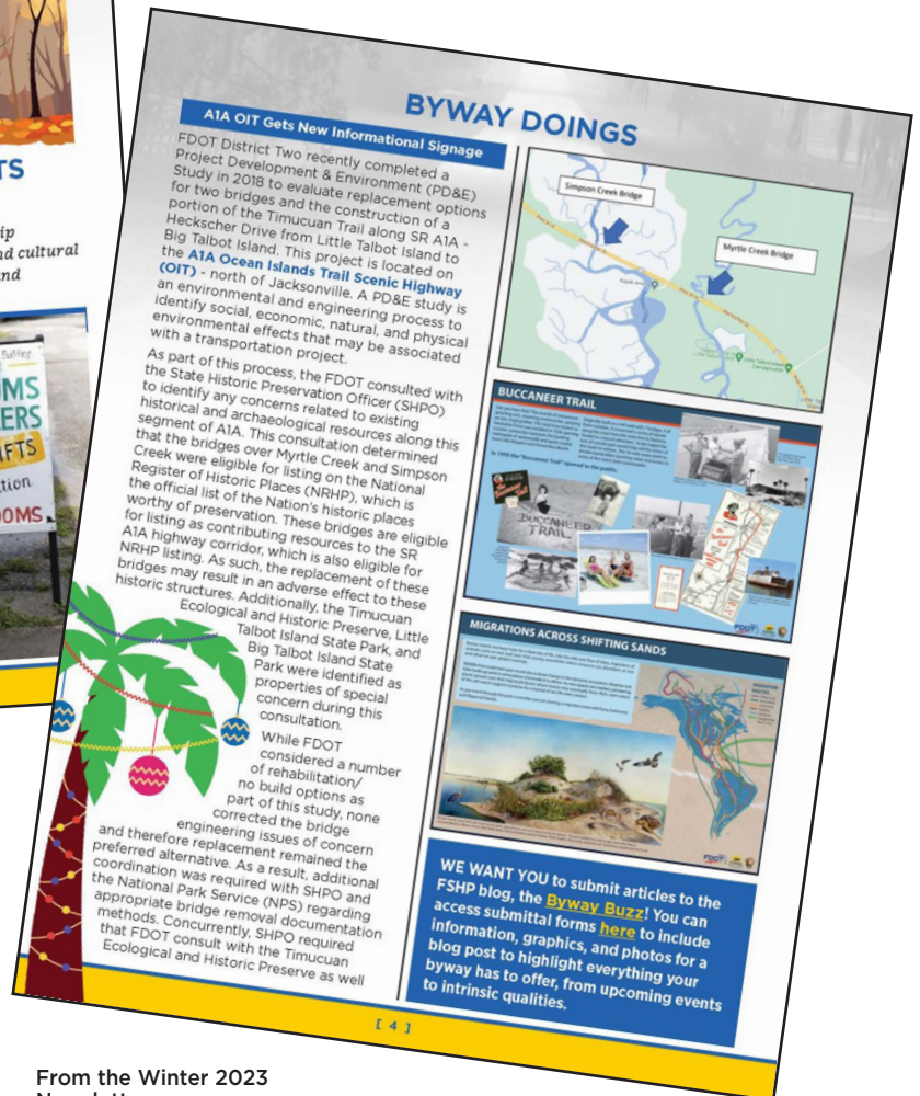
From the Winter 2023 Newsletter