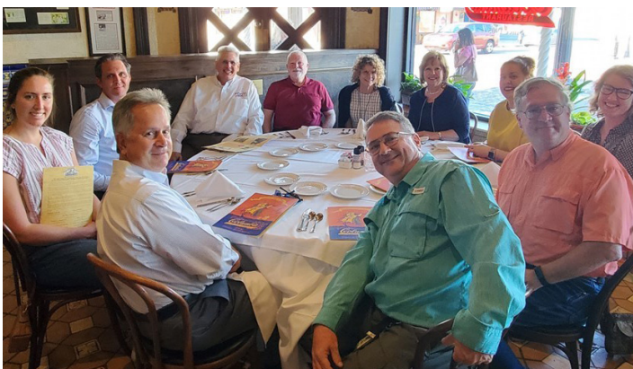
Florida Scenic Highway Program Coordinators' Dinner