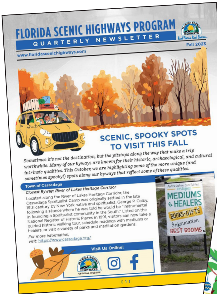
From the Fall 2023 Newsletter

Although the newsletter is only distributed to the program community, all previous newsletters can be viewed on the FSHP website.