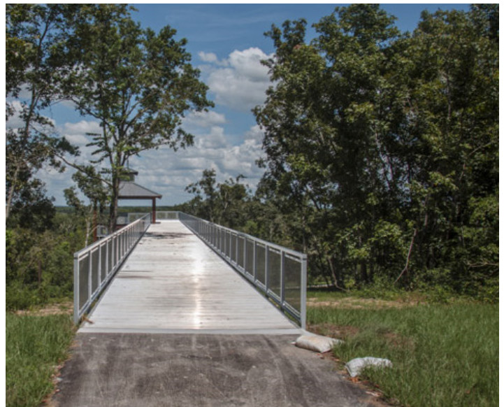
The Overlook as it currently appears in Spring 2023