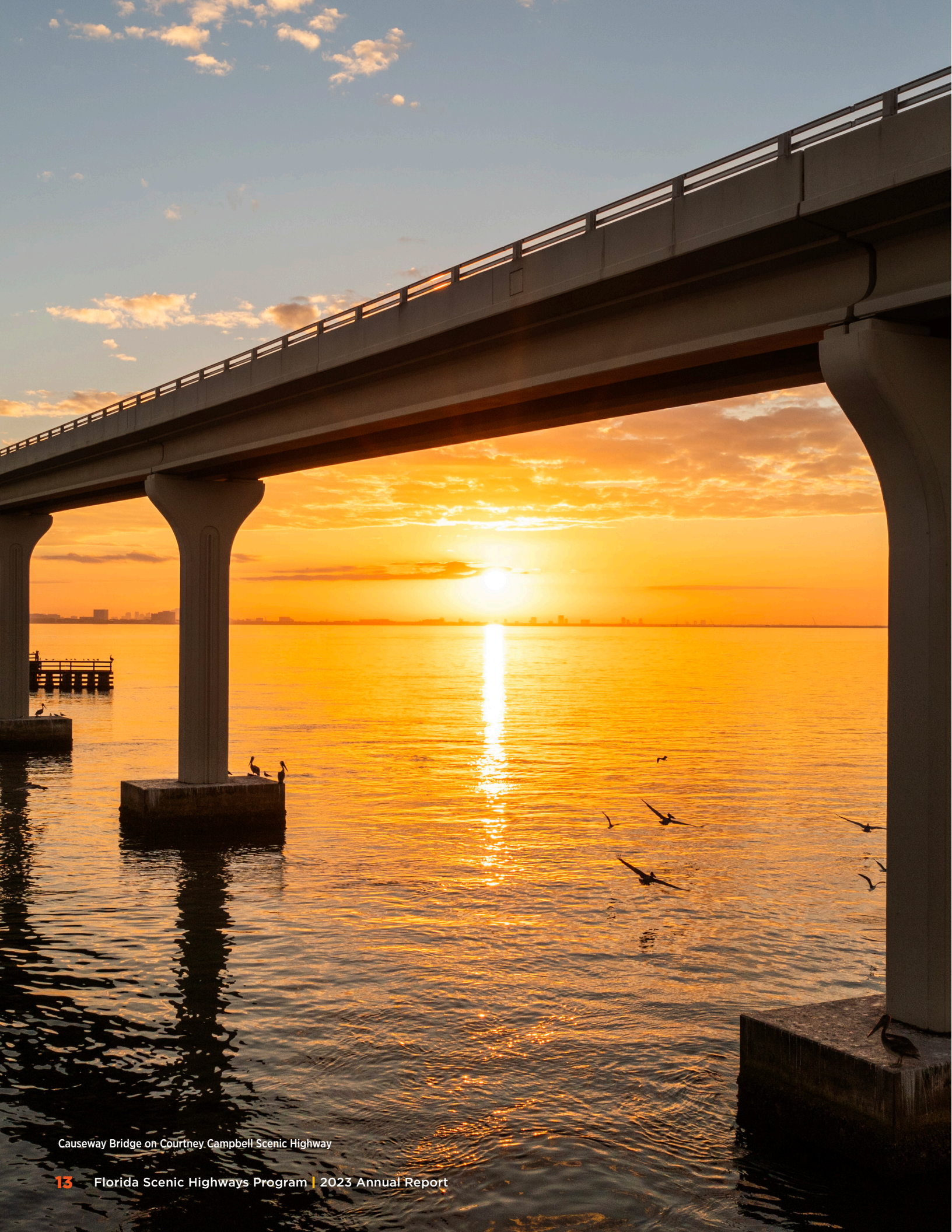
Causeway Bridge on Courtney Campbell Scenic Highway