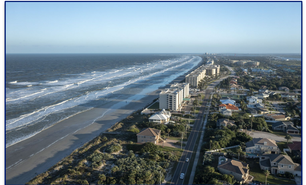
Halifax Heritage Byway, the Newest Byway of the FSHP