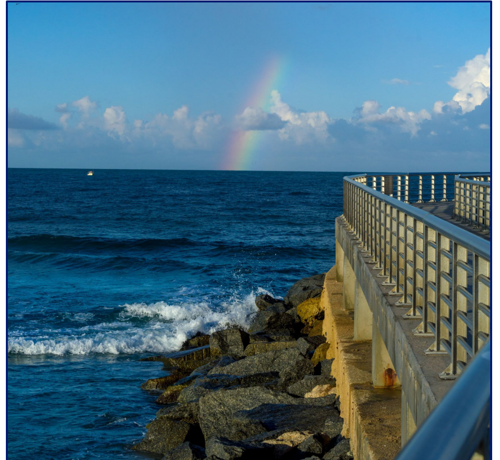
Sebastian Inlet along Indian River Lagoon National Scenic Byway