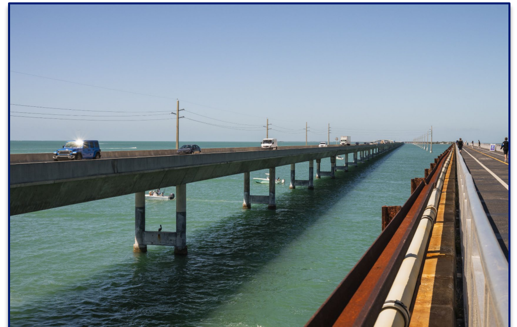
Florida Keys Scenic Highway, All-America Road