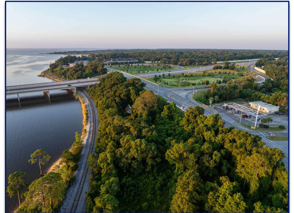
Pensacola Bluffs Scenic Highway, the First Byway of the FSHP